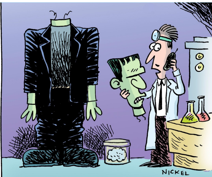
"Hello, tech support?"